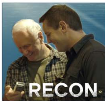
Social Media Profile