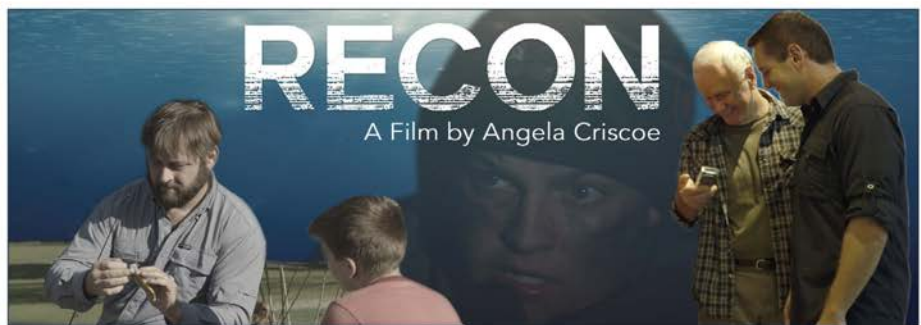
Social Media Header